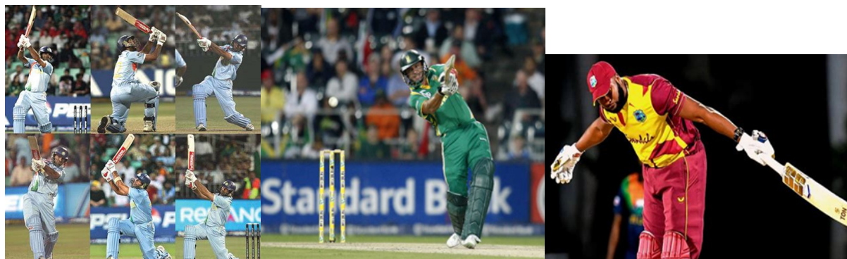
1st image-Pictures of Yuvraj Singh's follow through form after each of the six sixes he hit, circa 2007

Hitting six sixes in an over isn't just rare because of the rare probability of hitting six shots that go over the boundary consecutively, but because of the sheer skill it takes to do so. Additionally, sixes very rarely occur in a row, as bowlers switch up the type of ball they do in order to deter the batsman from reading their ball and being able to hit hard. It takes very skilled batsmen to be able to read the ball and hit sixes for an entire over. In fact, only three notable players are known to have hit 6 sixes in an over in international cricket: India's Yuvraj Singh, South Africa's Herschelle Gibbs, and recently, West Indies's Keiron Pollard. Each of these player's plays have been recorded and preserved, and I recommend you check them out. In my opinion, Yuvraj Singh's 6 sixes were the best, not only because of the way he was able to play them on different sides of the boundary, but also due to the fact that the game itself was a tense one. The captain of the opposing England team, Flintoff, had exchanged heated words with Yuvraj just before the over in which he hit those 6 sixes. To some, those sixes were even more special because of how it symbolized Yuvraj shaking off Flintoff's talk and showing everyone that he wasn't affected by it. It truly was a legendary moment not only for India's team, but also for the entire world of cricket.